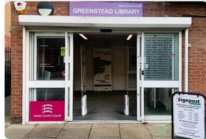
Signpost Greenstead, Colchester.